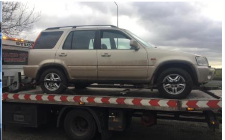
Seized for no insurance